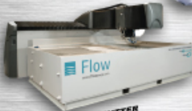
FLOW WATER JET CUTTER CUT UP TO 4 IN.