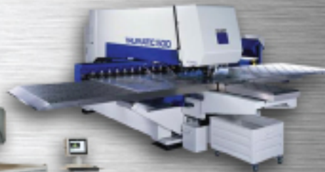
TRUMPF TC-500 CNC PUNCH