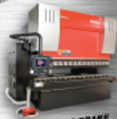
AMADA PRESS BRAKE UP TO 220 TONS & 14 FT