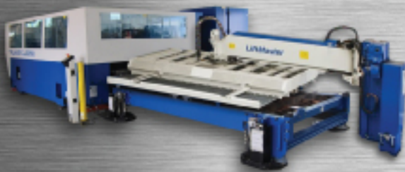
TRUMPF TRUMATIC L3050 LASER