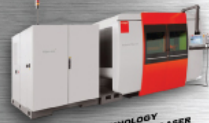
LATEST TECHNOLOGY BYSTRONIC FIBER OPTIC LASER